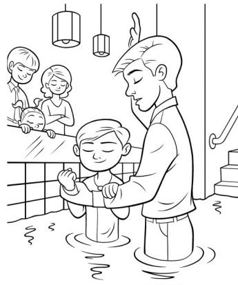
I can be baptized