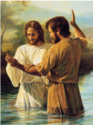
Jesus was baptized