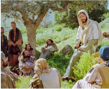
Jesus shared the gospel