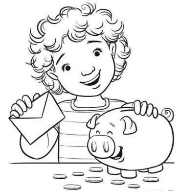
I can give

Come Follow Me- For Primary Show a few pictures of Jesus from His earthly ministry...Let the children help you explain what Jesus is doing in the pictures. How is He showing His love for Heavenly Father's children?