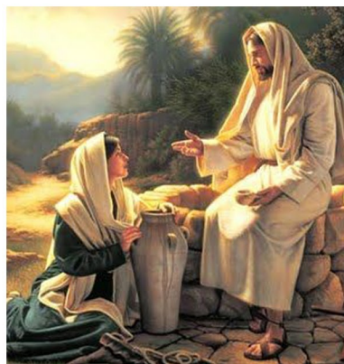
Jesus visited the lonely