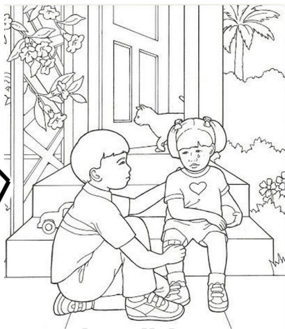
I can Help