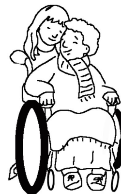
I can visit the lonely

Come Follow Me- For Primary Show a few pictures of Jesus from His earthly ministry...Let the children help you explain what Jesus is doing in the pictures. How is He showing His love for Heavenly Father's children?