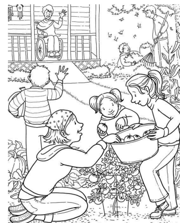
I can Serve